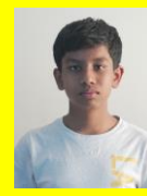
Krishnaang Gold Medal